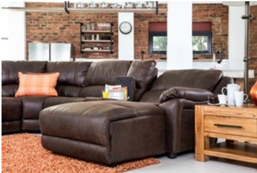
Tudor corner suite